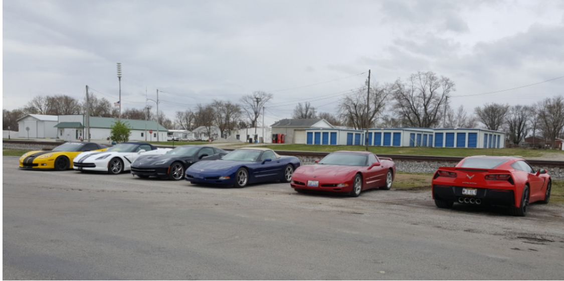
Little Egypt Corvette Club Rally