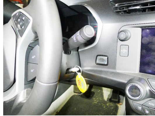
C6 slot location. C7 slot location.

Another tip. If you get stuck inside the C5, C6 or C7, (low car battery) you can release the door. On the floor to the side of the seat is a lever you pull up to open the door. Horn may sound.