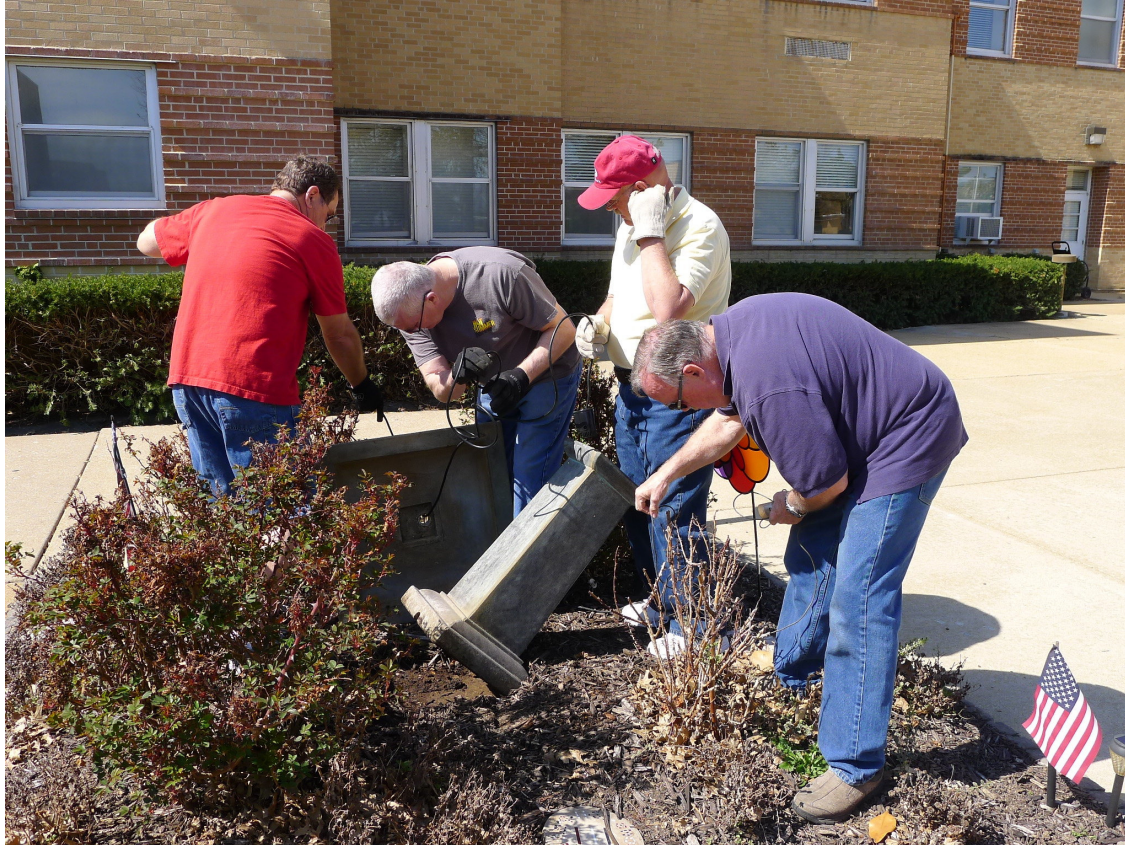
Preparing V.A. Garden and Fountains